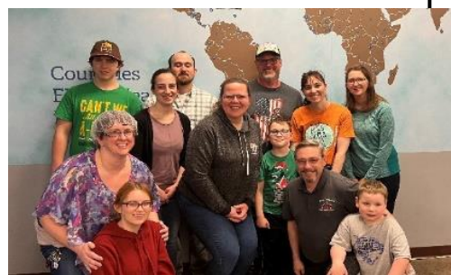
5-13-2023 – FMSC Event

To learn more about FMSC go to: https://www.fmsc.org/